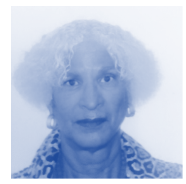
Trade of Jamaica.

Keywords: #Burundi #Sudan #Africa #Libya #Sahel #CentralAfricanRepublic #UNDP #UN #AU #Peacekeeping #Security